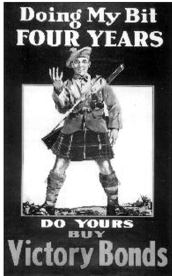
140. Doing My Bit for Four Years! Victory Bond poster, 1918.